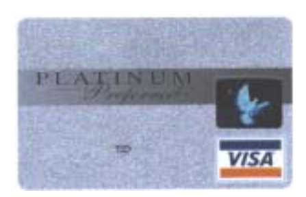
Apply for your card today and enjoy a low variable 6.0% APR

Our Visa Platinum Credit Card also offers you: